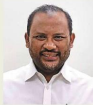
Ramli says ideally, there should be a recycling facility under each local council.

"However, we have seen that plastic wastes such as food containers and packaging materials from online shopping have increased, especially in urban areas.