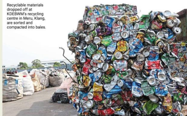
Recyclable materials dropped off at KDEBWM's recycling centre in Meru, Klang, are sorted and compacted into bales.

"We hope to set up two or three new recycling facilities in the next two years," he said.