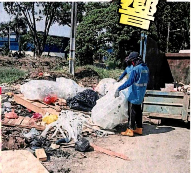
■14个地区的清洁工人 进行集体新冠肺炎筛检, 日常垃圾回收工作可能受到影响。