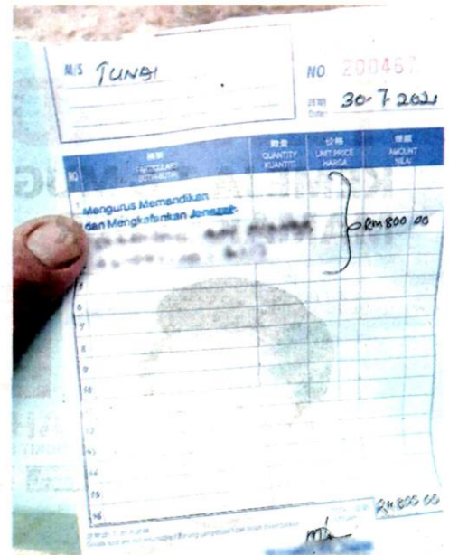
RESIT pembayaran pengurusan jenazah Covid-19 yang dibayar keluarga Nurain yang tular di Facebook baru-baru ini.

Perkara itu dipercayai berlaku kepada si mati yang beragama Islam dengan kewujudan kartel-kartel tertentu yang mengenakan caj tayamum sehingga RM730 bagi jenazah perempuan dan RM680 bagi jenazah lelaki walaupun proses itu hanya mengambil masa kurang seminit dan menggunakan debu tayamum berharga RM5.