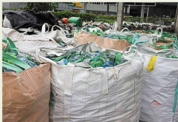
KDEBWM's recycling centre in Bandar Bukit Puchong, Selangor, has seen an increase in plastic waste such as food containers and packaging materials from online shopping.