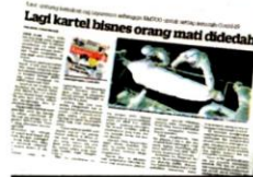
KERATAN Kosmo/ 22 Julai 2021.

Katanya, lelaki tersebut mengenakan caj sehingga RM800 dengan memberikan resit pembayaran seperti digunakan di kedai runcit dengan menyatakan tujuan resit untuk mengurus memandikan dan mengkafkan jenazah.