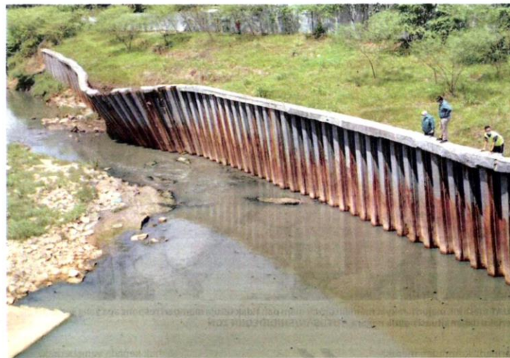
KAKITANGAN JAS melakukan pemantauan di Sungai Kim Kim selepas menerima aduan bau busuk daripada penduduk berhampiran Kampung Bukit Pulai di Pasir Gudang, Johor.

"Ini bukan sahaja merujuk kepada pembangunan industri, tetapi sumber pencemaran domestik dan komersial seperti